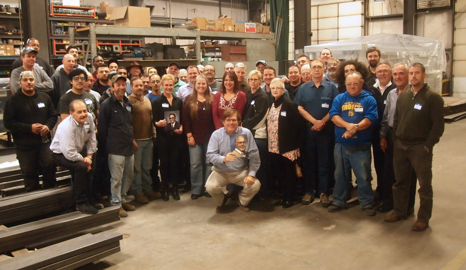
Above: Armil's staff celebrates 50 years with a luncheon

commitment to Burnout and Pre-heating furnaces is evidenced by their customer base in aerospace, medical and commercial investment casters. With their designs including roller, pusher and rotary hearths, box and car bottom furnaces they have a foundation in every style of mold processing. "We set the standard in afterburners and emission control meeting the most stringent requirements," Finnery concluded.